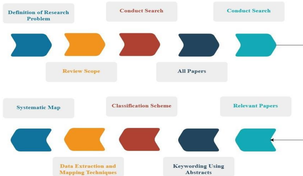
Figure.2. Systematic Selection Criteria for Research Papers

To further screen the papers, the authors reviewed over chosen paper abstracts and, in certain cases, introductions and conclusions. 52 research papers were chosen as a result. Five further papers were eliminated after carefully reading each of the five that had been chosen because they lacked a healthcare-related focus. These articles do not offer any original ideas or suggestions and one of the subsections only mentions possible applications of blockchain in healthcare. After screening, 46 articles were selected for the study, as shown in Fig. 2. The data was conducted using following electronic database such as IEEE Xplore, BMC Medicine, medical journals, these databases were designated on the base of various collected journal and conference on emerging topics including blockchain.